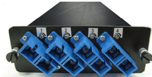
SC Single VOA Module, Part #N0100-0100